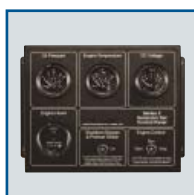
Length - 10" x Height - 8" x Depth - 4"

Panel Includes: Run light, engine hourmeter, start/stop, and shutdown bypass/preheat switch.