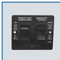
Length - 3.38" x Height - 2.88"

Choose the amount of control you need, and the flexibility you want. Northern Lights offers several control panels for models up to 30kW, each available in 12 or 24 volt. These handsome panels allow you to monitor and control your generator from one or several locations on board. Custom panels available.