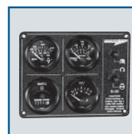
Length - 7" x Height - 5.25"

Panel Includes: DC voltmeter, water temperature gauge, oil pressure gauge, engine hourmeter, start/stop, and shutdown bypass/preheat switch. Includes a NEMA enclosure.