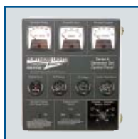
Length - 14" x Height - 17" x Depth - 6.25"

Panel Includes: DC voltmeter, water temperature gauge, oil pressure gauge, engine hourmeter, start/stop, and shutdown bypass/preheat switch. Available with enclosure.