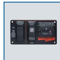
Length - 5.5" x Height - 2.88"

Panel Includes: Run light, start/stop and shutdown bypass/preheat switch.